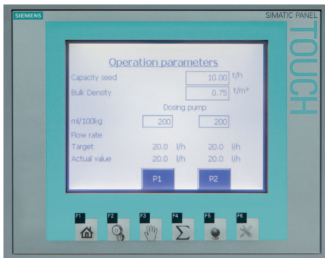
Interior of the treater